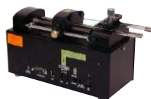
Pump 11 Elite/Pico Plus Elite