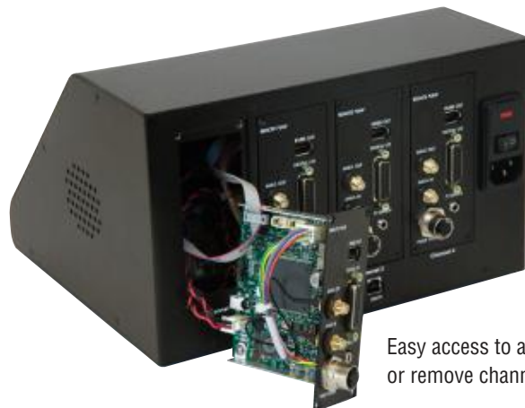
Easy access to add or remove channels

An entire suite of ASCII commands is available to control the pump remotely with a PC. The pump contains a footswitch input and digital Input/Output for each independent pumping channel.