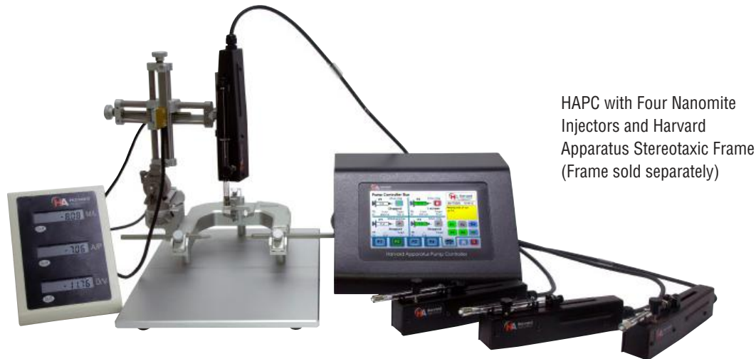
HAPC with Four Nanomite Injectors and Harvard Apparatus Stereotaxic Frame (Frame sold separately)

Run up to four precision infusion experiments—simultaneously