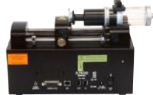
Pump 11 Elite/Pico Plus Elite