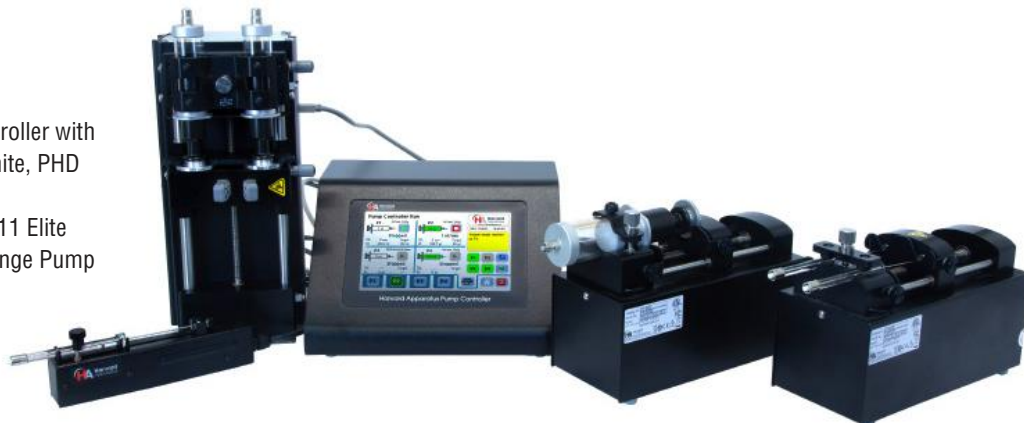
Pump Controller with one Nanomite, PHD ULTRA™, and Pump 11 Elite Family Syringe Pump Modules

Precision infusion for accurate, reliable and repeatable results is critical to the success of your work. High experiment throughput is essential to keep up with your rapidly changing research area. When using fluidics in research, it can be difficult to know which solution will provide the most reliable and repeatable results, yet best supports high throughput and concurrent experiments.